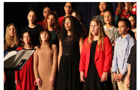
Middle & High School Choir Concert