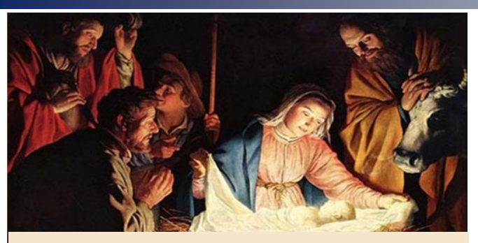
ST. PETER MUSIC SERIES PRESENTS