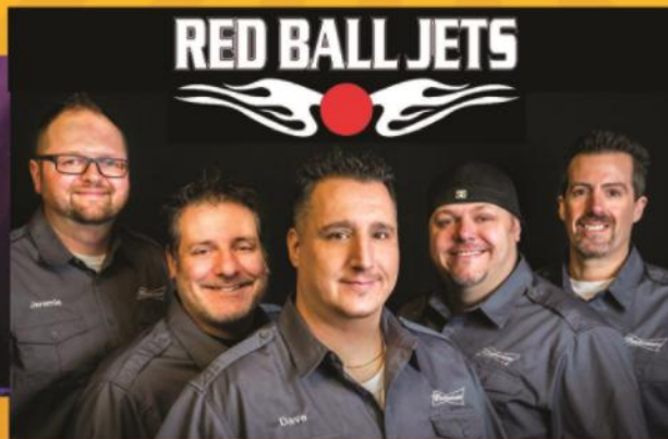
RED BALL JETS